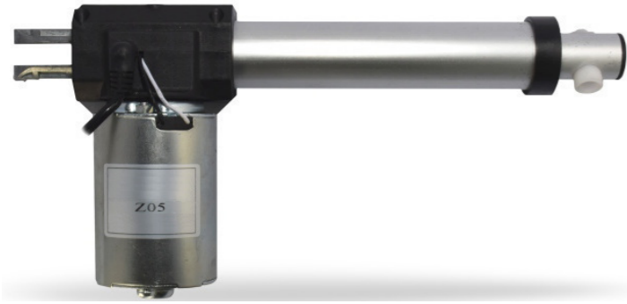
Direct-Drive Linear Actuator 直顶电动推杆